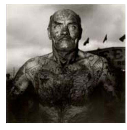
Social Documentary Photography

An example of a photographer is: Diane Arbus